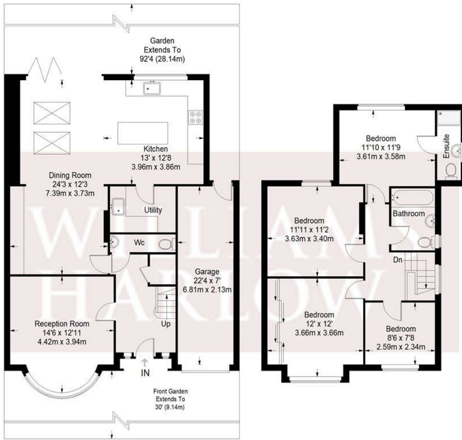
Ground Floor = 947 sq ft